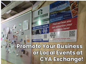
Promote Your Business or Local Events at CYA Exchange!